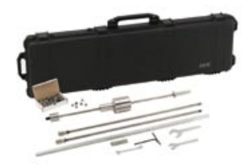
Typical Dual Mass Penetrometer Kit